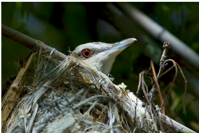
Figure 6. This female Red-eyed Vireo was paired with a Warbling Vireo in July 2013 at Rancho San Rafael Park in Reno.