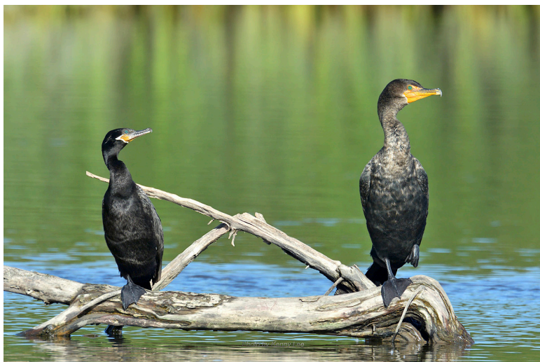
Figure 1. The Neotropic Cormorant has increasingly been joining its cousin, the Double-crested Cormorant ( Phalacrocorax auritus ), on southern Nevada waters in recent years. This adult was observed at the Clark County Wetlands Park over four months, October 2014–February 2015.