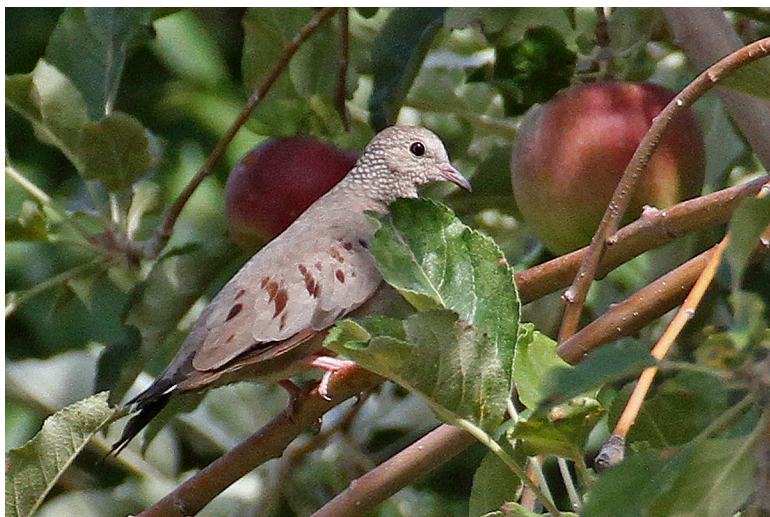
Figure 3. There are now five NBRC-endorsed records for the Common Ground-Dove in Nevada; the species was of “irregular occurrence” from the early 1960s to mid-1970s (Alcorn 1988:183), but since then only four records are confirmed, including the one of this female in Esmeralda County, 7–8 September 2014.