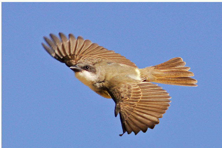
Figure 5. This second Thick-billed Kingbird for Nevada was found at the Overton Wildlife Management Area on 7 November 2014, where it remained for over a week. Nevada's first representative of the species was observed in October 1996.