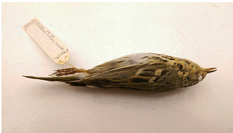
Figure 9. This Olive-backed Pipit, the second for North America, was collected on 16 May 1967 near Reno by Thomas D. Burleigh (1968). The specimen is preserved in the U.S. National Museum of Natural History, Smithsonian Institution, Washington, DC.