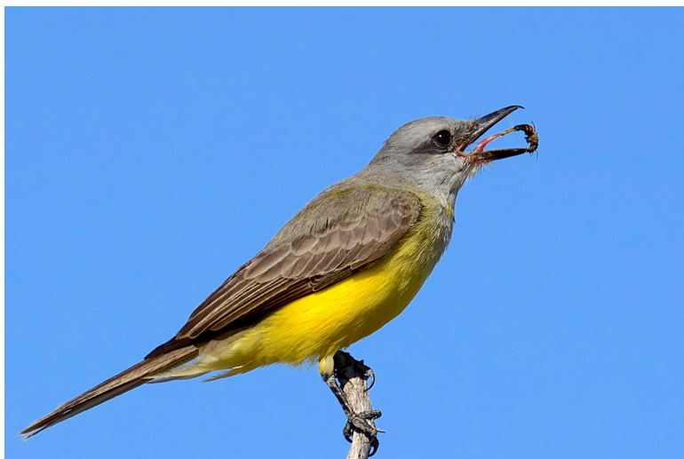
Figure 4. Another first for Nevada, this Couch's Kingbird delighted local and visiting birders for nearly two months (12 January–4 March 2015). The identification was confirmed by vocalizations and wing formula.