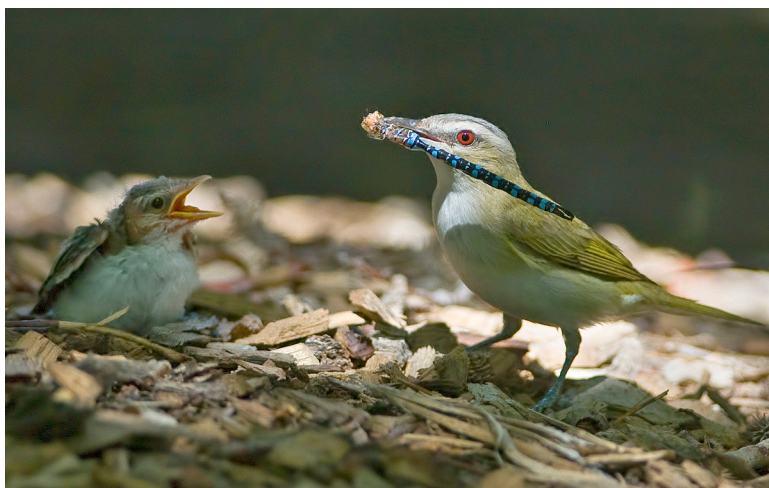
Figure 7. The two young fledged by the mixed pair of vireos in Reno did not survive their first month; one specimen was analyzed to confirm hybridization. This nesting was followed by an incursion of additional post-breeding Red-eyed Vireos, detected as singing males.