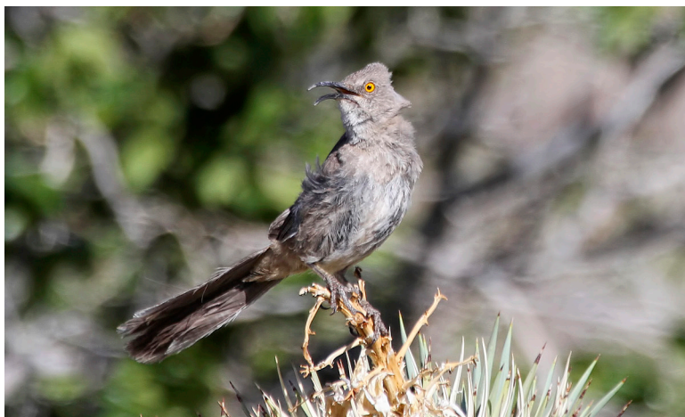
Figure 8. After the Curve-billed Thrasher was first noted at Searchlight, Nevada, on 7 June 2014, three birds were observed in September 2014. Since that time, reports of one or two individuals continue to come in to the NBRC and are posted at www.eBird.org regularly, though nesting has yet to be documented.