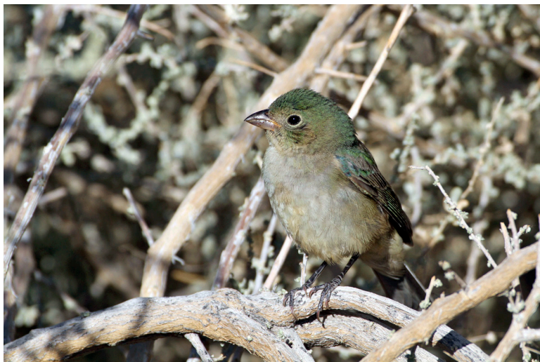
Figure 10. All of Nevada's four accepted records of the Painted Bunting during the 2015 review period were of immature/female-plumaged birds such as this one at the Corn Creek Field Station, Desert National Wildlife Refuge in Clark County, 8 September 2014.