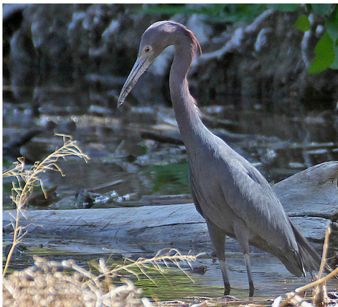
Figure 4. Documentation for Nevada’s fourth endorsed record of the Little Blue Heron covers the dates 28–30 May 2014, but reports to www.eBird.org and the Nevada Birds Listserv indicate that the bird may have been present for at least another three weeks. All four records are of adults in Nevada’s southernmost county, Clark.

HARRIS’S HAWK Parabuteo unicinctus (8, 1). 2013-103, Las Vegas (Clark), 19 Oct 2013–17 Jan 2014. N. McDonal; C. Grant (P). Two reports documented a Harris’s Hawk in the same general vicinity in Las Vegas. The committee voted to consider both as representing the same individual and suspected it was a wanderer