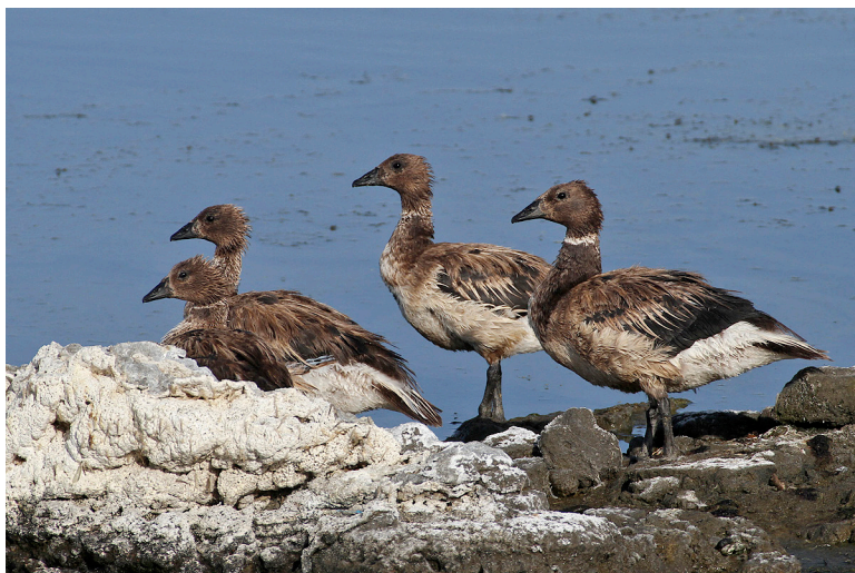
Figure 1. This group of heavily worn Brant lingered at Big Soda Lake, Churchill Co., from 6 Aug to 14 September 2013, providing viewing opportunities for many northern Nevada birders.