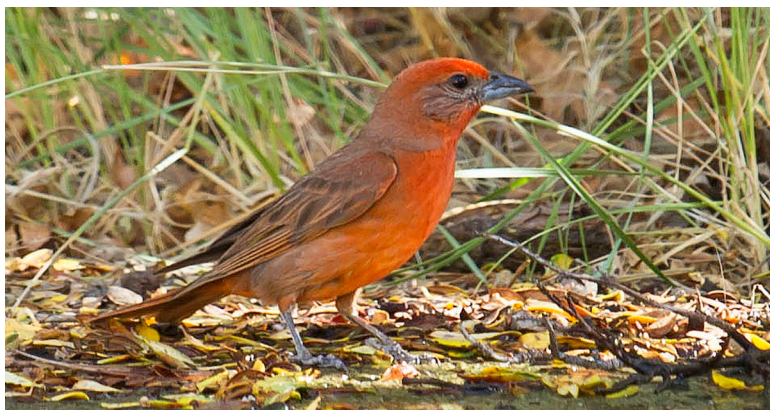
Figure 12. The NBRC has endorsed only two records of the Hepatic Tanager, a species that has been inferred, by extrapolation from three records of single birds (Johnson 1965), to breed regularly in the mountains of southern Nevada. Given the remoteness of some of the suitable habitat, that assumption may be correct, but this adult male at an easily accessible campground on Mt. Charleston, Clark Co., from at least 4 to 24 July 2014, is the first recorded in the Spring Mountains and the first in any of southern Nevada's mountains since 1963.