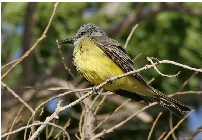
Figure 9. This Tropical Kingbird at Miller's Rest Stop, Esmeralda Co., 17 June 2014 is the first to be endorsed by the NBRC. Documentation for earlier sightings did not eliminate Couch's Kingbird. Fortunately, this bird was video-recorded vocalizing repeatedly, confirming the identification.