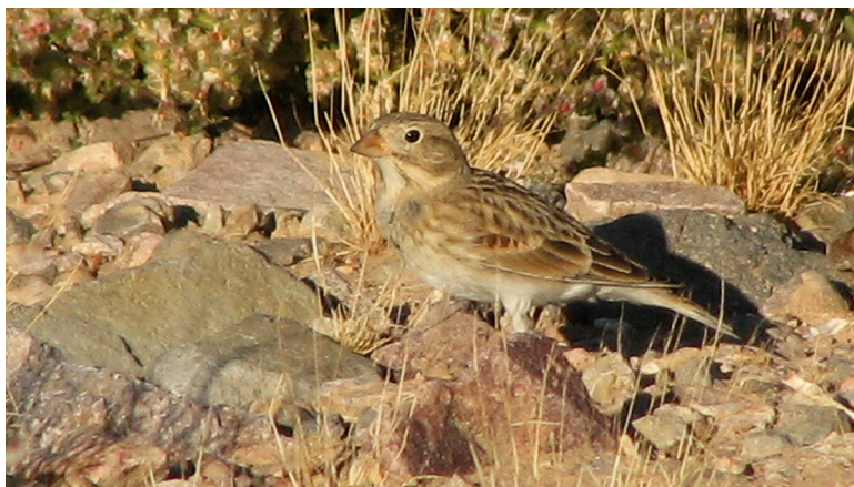
Figure 10. The Lapland ( Calcarius lapponicus ) and Chestnut-collared ( C. ornatus ) Longspurs have proven to be fairly regular visitors to Nevada in fall and winter, and both species have been removed from the Nevada review list. But McCown's is encountered considerably less frequently. This male found near the shoreline of Lake Mead on 26 October 2013 was the fifth to be endorsed by the NBRC. Smith's Longspur ( C. pictus ) has been satisfactorily documented twice.