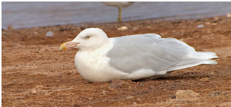
Figure 8. Of Nevada’s 15 endorsed records of the Glaucous Gull, three have been of adults, like this individual at Las Vegas Bay, Lake Mead, 11–23 January 2014.

The first two reports are of Tropical/Couch’s ( T. couchii ) Kingbirds, but their documentation was insufficient for species identification. Record 2014-024, on the other hand, was supported with extensive recordings of vocalizations, as well as