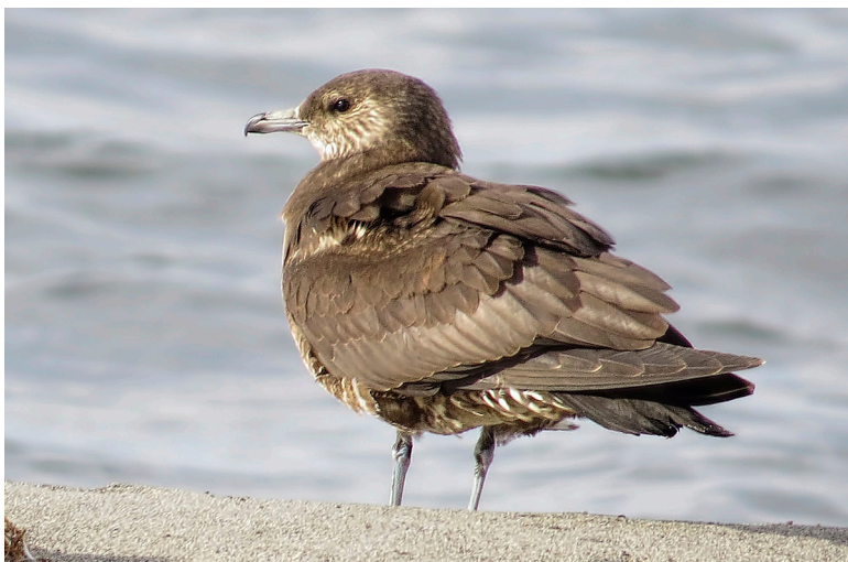
Figure 6. Most of Nevada's Parasitic Jaegers have been seen only in flight, occasionally perched or swimming at a distance. But this subadult photographed at close range at Pyramid Lake, Washoe Co., 3–7 September 2013 allowed superb documentation of features such as the shape and pattern of the bill and the characteristic warm tones to the plumage.