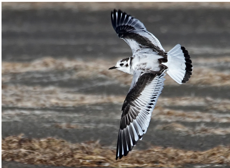
Figure 7. This first-cycle Little Gull at Pyramid Lake, Washoe Co., represents a second record for Nevada. It remained for only one day, 30 October 2013.

2014-037, Upper Las Vegas Wash (Clark), 25–26 Jul 1972. C. S. Lawson (P, #UNMB 1748). Lawson (1973b) wrote, "On 26 July 1972 I collected a Red Phalarope ... from a flock of about 250 phalaropes. The flock consisted of 4 or 5 Red Phalaropes in winter plumage, 225 Wilson's Phalaropes..., and 25 Northern Phalaropes." The preceding day, Lawson had photographed a male in breeding plumage, the same plumage as the specimen (unpublished notes and slide on file). Because of the inconsistencies regarding the number of birds and their plumage, the committee endorsed only a single individual.