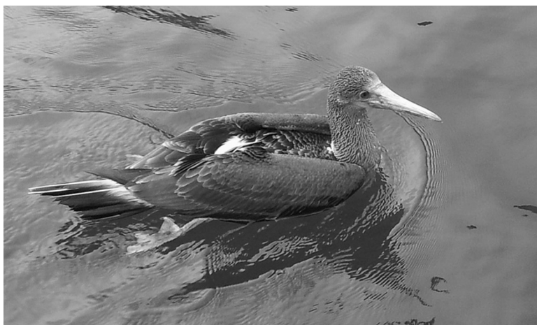
Figure 2. This cooperative Blue-footed Booby (2102-060) was in the Boulder Canyon section of Lake Mead on 21 August 2012. It represents only the second record of the Blue-footed Booby the NBRC has endorsed, following the first in 1971 (Lawson 1973).