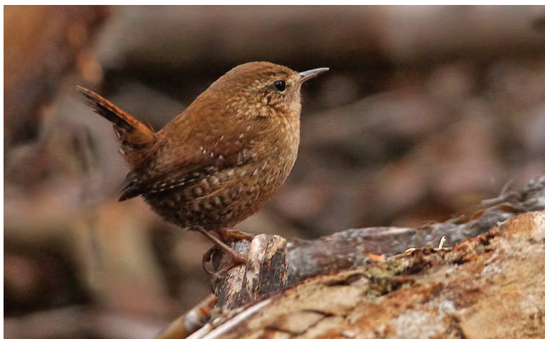
Figure 7. Nevada's second endorsed Winter Wren was extensively photographed and audio and video recorded during its stay in a heavily wooded area at the north end of Pahranaagat NWR (photo 11 November 2011). The overall paler color, especially of the throat and breast, helped to distinguish the bird from several Pacific Wrens present in the same area, but the opportunity to compare call notes provided the best identification criterion.