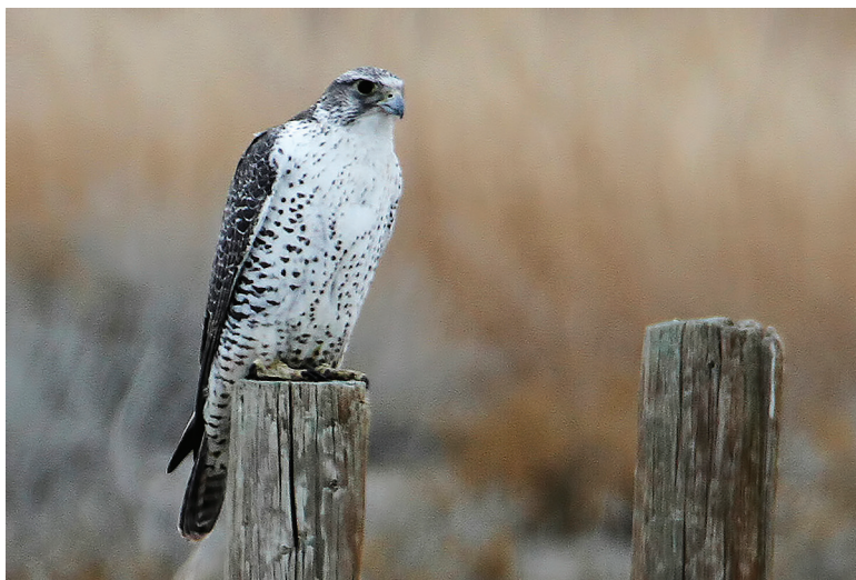
Figure 6. Adult Gyrfalcon of the gray morph found by Bill Henry at Stillwater NWR, 15 January 2012.