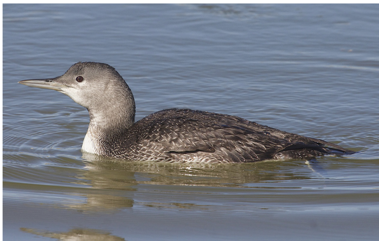
Figure 1. Juvenile Red-throated Loon in the Duck Creek area of the Clark County Wetlands Park, photographed 25 November 2011, one of three Red-throated Loons documented in Nevada in 2011.