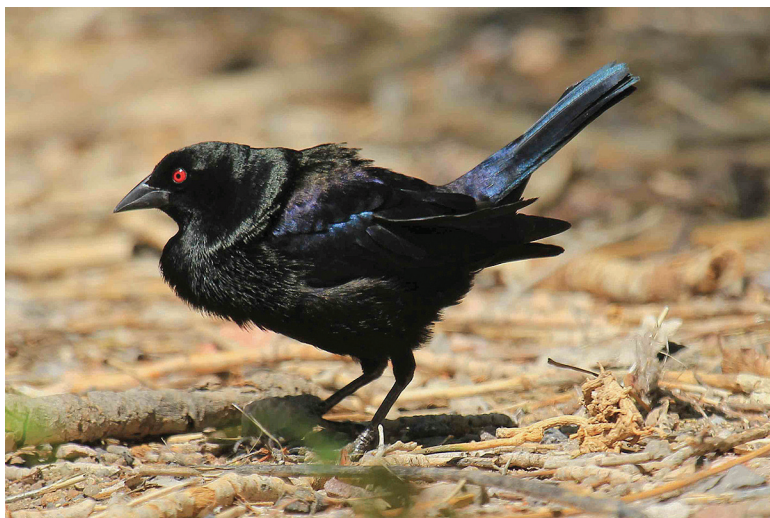
Figure 9. Third Bronzed Cowbird documented for Nevada, near Beatty, Nye County, 19 May-21 June 2011. A male, it displayed repeatedly to the many female Brown-headed Cowbirds in the area.