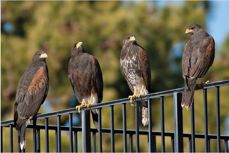
Figure 3. The first documentation of these Harris's Hawks was on 14 December 2011, although residents of the area in Boulder City related that at least two of the birds had been present well before that date. This photo was taken 14 January 2012. Christina Nycek monitored the birds throughout their stay and reported young in a nest on 10 May 2012, the first confirmed nesting of Harris's Hawk in Nevada.