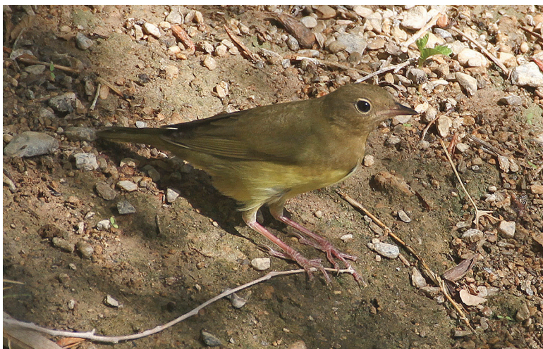
Figure 8. Nevada's third endorsed Connecticut Warbler at Floyd Lamb Park, Las Vegas, 3-4 September 2011, the first to be documented with video.