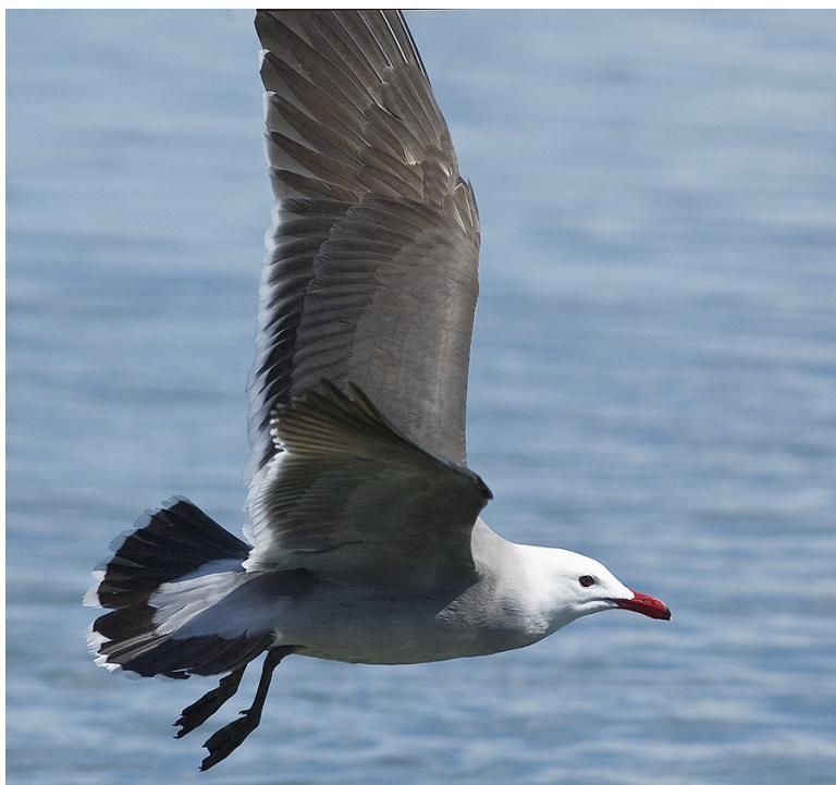
Figure 5. Heermann's Gull at Virginia Lake, Reno, 19 April 2012.