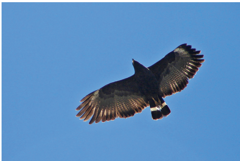
Figure 2. This Common Black-Hawk (2010-030) was with another of its species in Meadow Valley Wash, Lincoln Co., 29–30 May 2010 (photo taken 30 May). The two were observed engaging in talon-grappling and other displays.