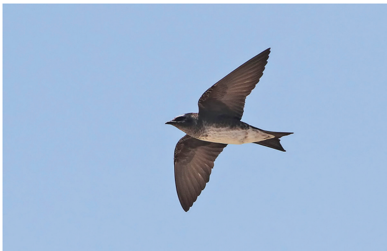
Figure 6. The Purple Martin has been satisfactorily documented to the NBRC only eight times. This bird (2011-030) was at Dyer, Esmeralda Co., 28 May 2011.