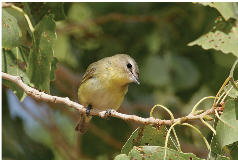
Figure 5. This Philadelphia Vireo (2010-059) at Floyd Lamb Park, Tule Springs, Clark Co., 19–23 October 2010 (photo taken 21 October), is the second to be satisfactorily documented in Nevada. This cooperative bird pleased birders who had been waiting for 15 years since the state's first record (1995-22), at Indian Springs, Clark Co., 23 September 1995.