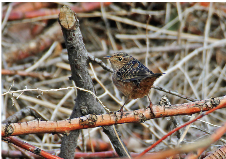
Figure 7. This wonderful photo left no doubt in anyone's mind about the identification of Nevada's first recorded Sedge Wren (2011-101). The bird was found 15 October 2011 at a ranch in Dyer, Esmeralda, Co., and was gone by the next day.