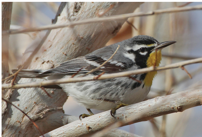
Figure 8. The fourth Yellow-throated Warbler (2011-001) to be endorsed by the NBRC was at Moapa National Wildlife Refuge, Clark Co., 2-16 January 2011 (photo taken 16 January).