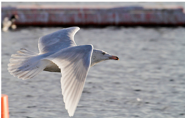
Figure 4. Many birders who visited the Reno/Sparks area in January 2011 to observe Nevada's first Iceland Gull (2011-004) received a bonus with this Glaucous Gull (2011-005), as both were often seen sitting on the same set of floats at the Sparks Marina, Washoe Co. The Glaucous Gull was present 26–29 January; this photo was taken 28 January 2011.