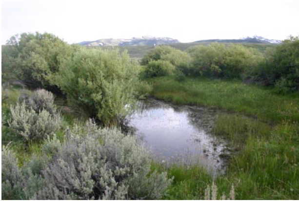
A spring in Washoe County.