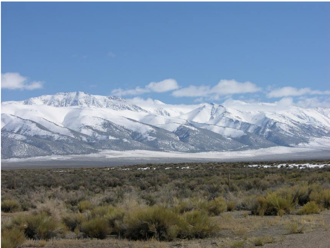
Sagebrush habitat in Duck Creek Valley, White Pine County.