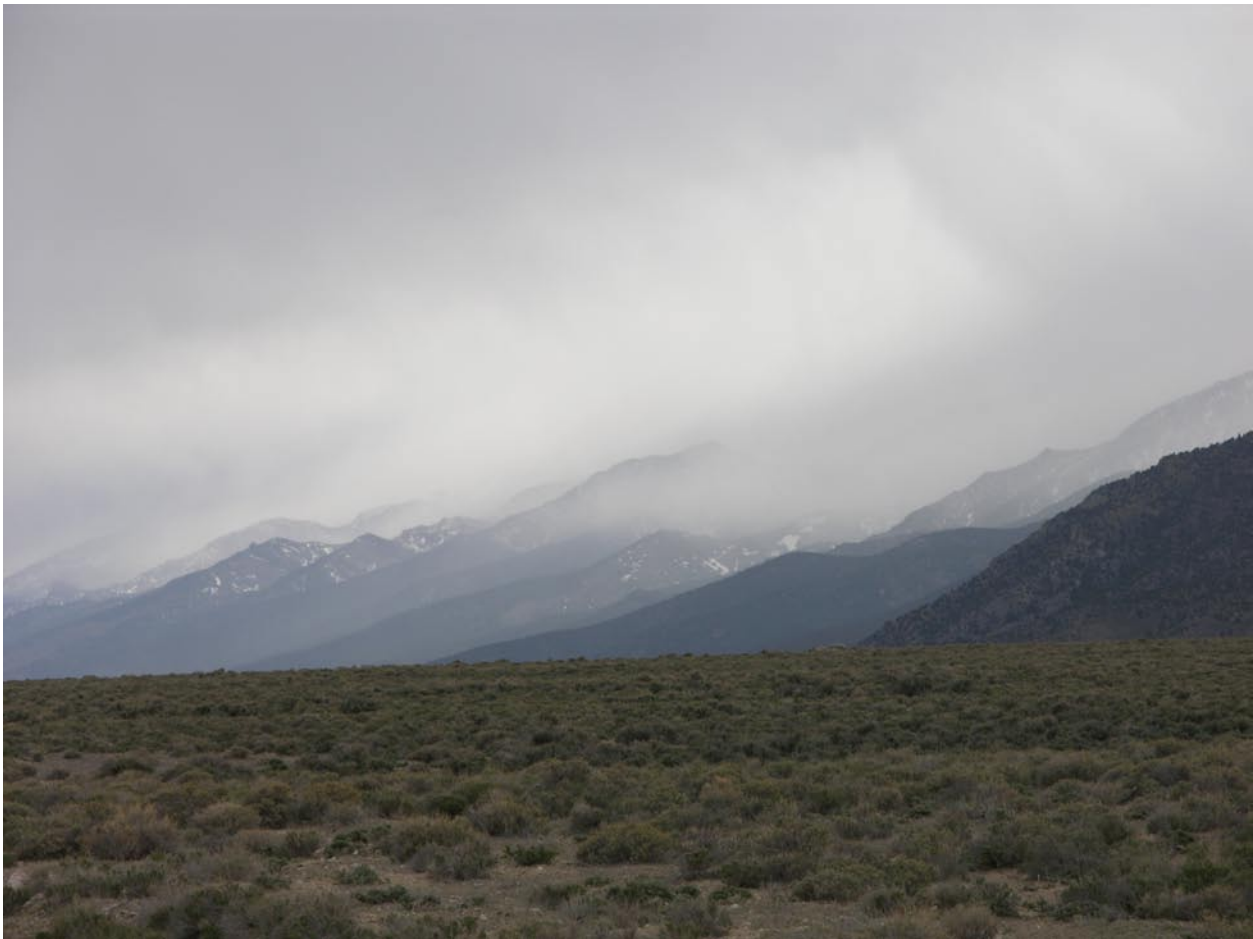
Sagebrush habitat in North Spring Valley, White Pine County.