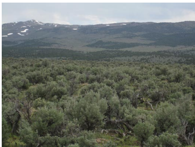
Sagebrush habitat in Duck Creek Valley, White Pine County.