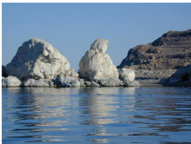
Stone Mother on Pyramid Lake, Washoe County, with waterbirds in the foreground.