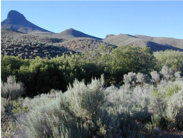
Montane Riparian habitat at China Creek in the Montana Range, Humboldt County.