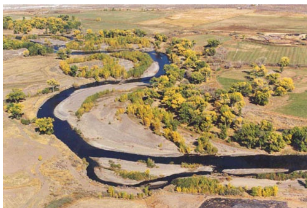
Lowland riparian corridor along the Lower Truckee River, Washoe County.