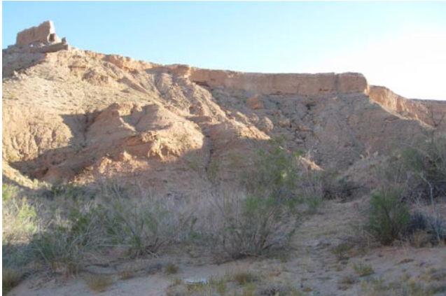
Peregrine Falcon nest cliff near Lake Mead, Clark County.