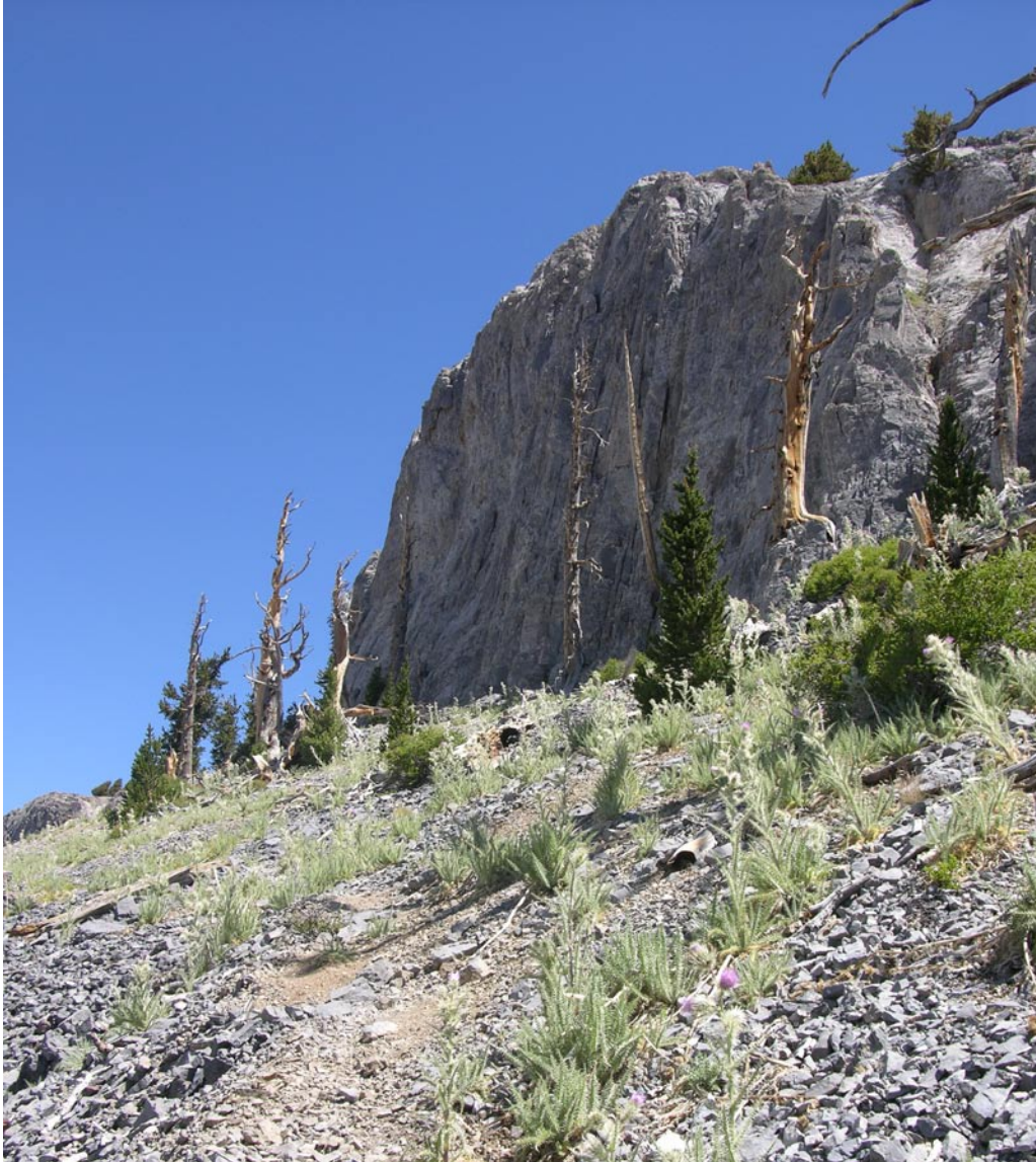
Cliff in the Spring Mountains.

As a general rule, we expect that the conservation concerns associated with surrounding habitats that support prey populations are more important to cliff nesting birds than the conservation concerns affecting the cliffs directly. These concerns are outlined in the habitat accounts for the Montane Shrubland, Sagebrush, Salt Desert Scrub, Wet Meadow, Great Basin and Mojave Lowland Riparian and Montane Riparian, and Open Water habitat types.