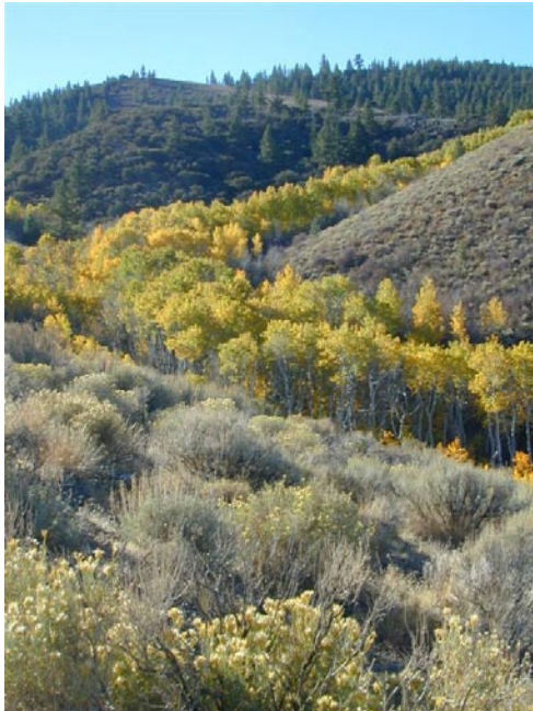
Aspen patch in the Great Basin (Peavine Peak, Washoe County).